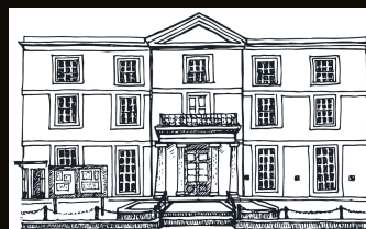
Peterborough Museum & Art Gallery

Mapping Archaeological Heritage in South Asia